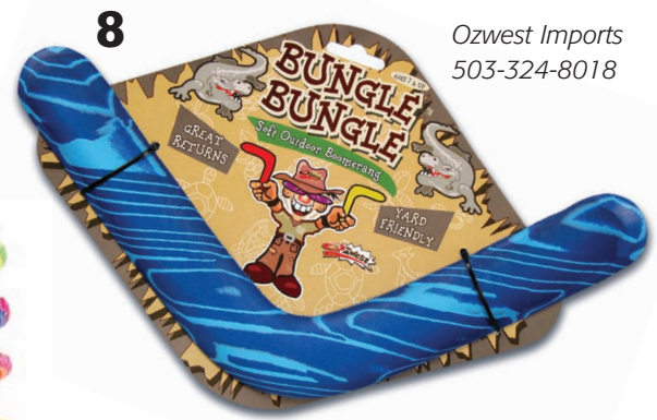
Ozwest Imports 503-324-8018

“ Glee Gum (12) from Verve is cool. It’s made with chicle from the rainforest. Parents really like that it’s all-natural and made in the U.S. The packaging is really neat. We can’t keep it in stock. Everyone seems to pick up a couple packages as they check out.